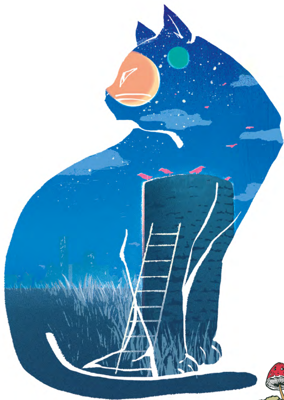
Tell Your Children